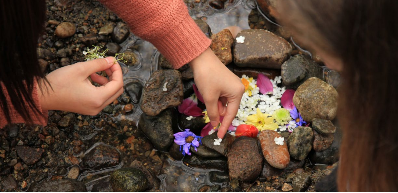
▲ Youth-led stewardship activities at the Renfrew Ravine

diverse and multi-generational. This model could be small and focused, could be in one location or several, could be led by Park Board and/or community partners, and could potentially grow into a purpose-built centre of excellence for PBEE.