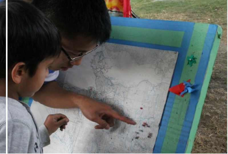
◀▲ Weaving projects, water sampling, and children's educational activities in Vancouver parks