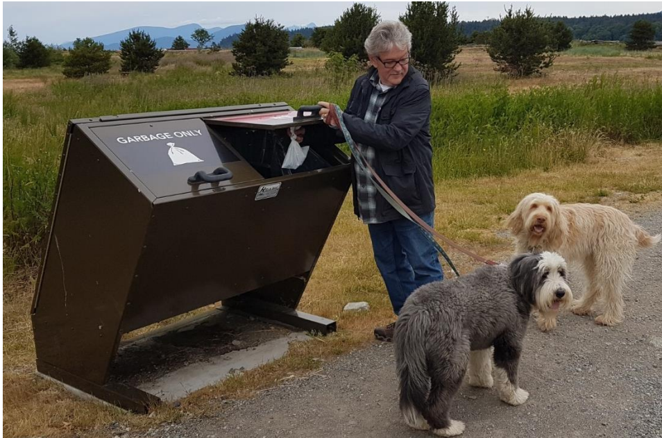
Figure 1. A pet owner puts his pet's waste in a designated bin.

Currently, pet owners can use any type of bag to pick up their dog's waste and then place the bagged waste in a red labelled recycling bin. These bins are usually found alongside other waste bins (figure 1). Metro Vancouver has engaged residents to sort their waste for many years and, especially because dog waste receptacles are next to other waste receptacles, there is a low barrier to participation for pet owners.