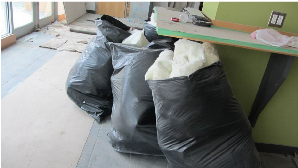
Figure 6 Isolation stored on-site to be reused in the same project, Project: University Centre - Contractor: Scott Special Projects