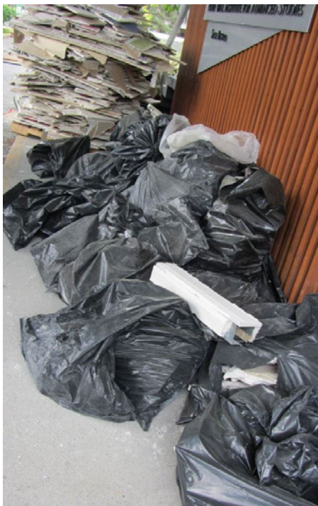
Figure 12 Project: University Centre - Contractor: Scott Special Projects