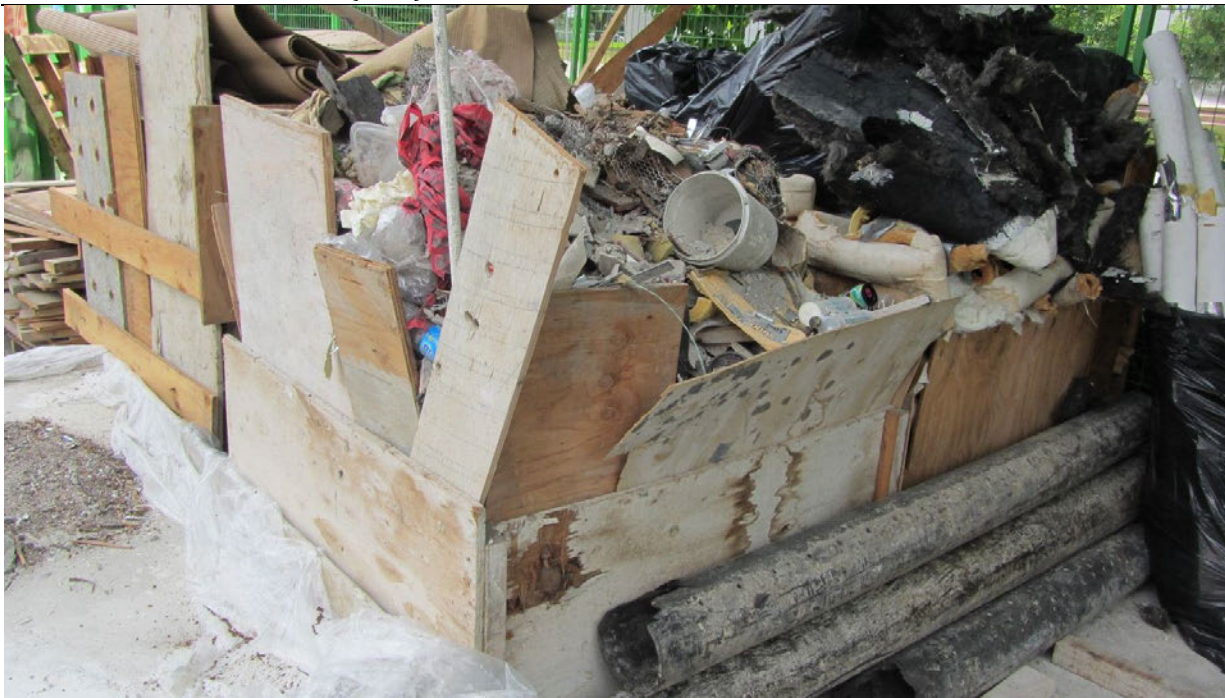
Figure 15 Mixed waste, outside of building on project's site, Project: University Centre - Contractor: Scott Special Projects