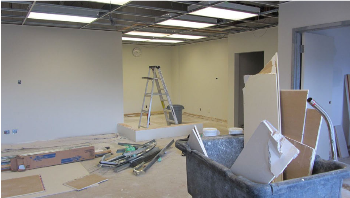
Figure 28 Small drywall bin, inside the building, Project: CEME Lab - Contractor: Holaco Construction