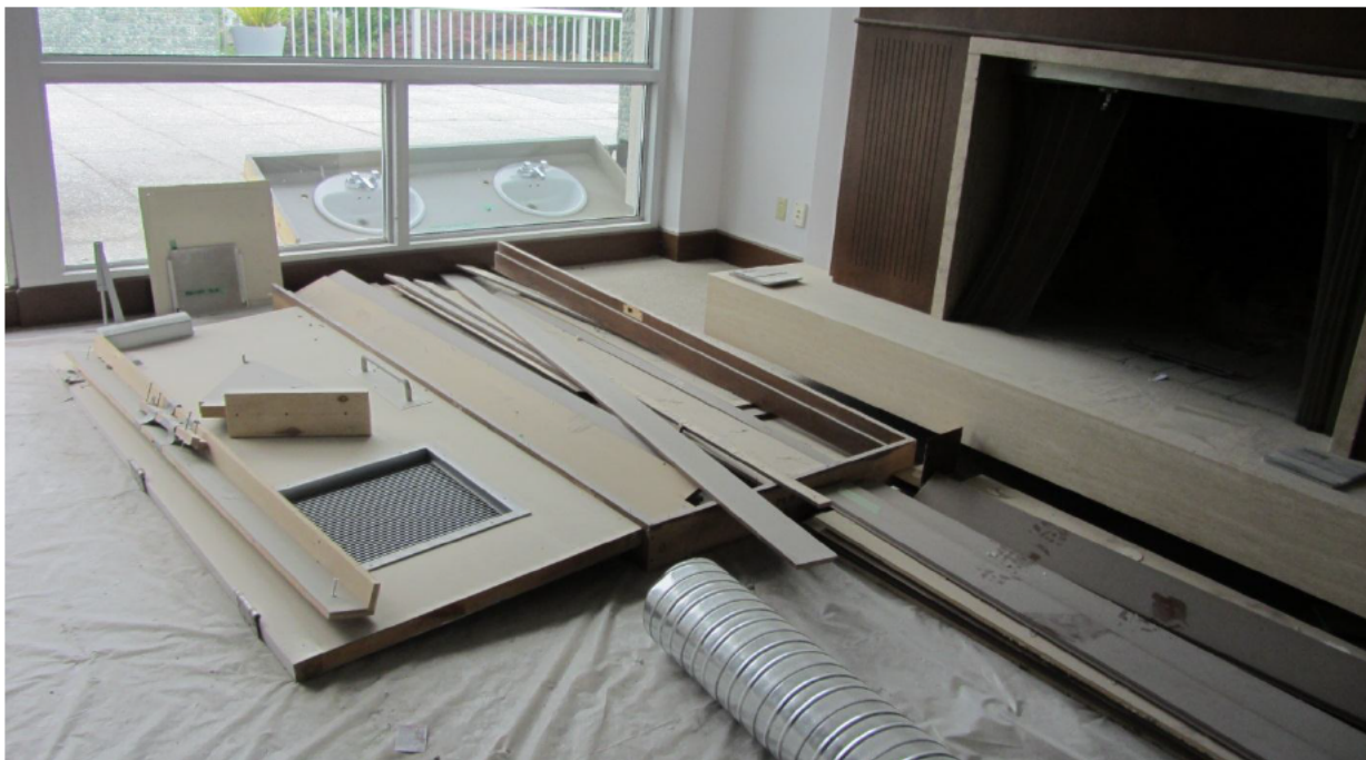
Figure 8 Doors stored on-site to be reused in the same project, Project: University Centre - Contractor: Scott Special Projects