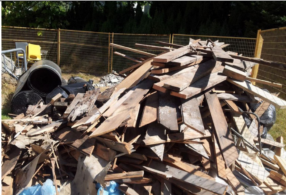
Figure 24 Wood waste pile collected outside of building on project's site, Project: Geography Building - Contractor: EL Shaddai Constructio