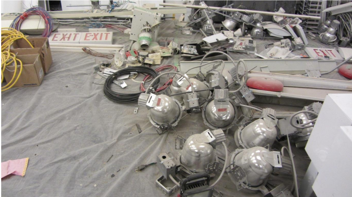
Figure 9 Lightings, stored on-site to be reused in the same project, Project: University Centre - Contractor: Scott Special Projects