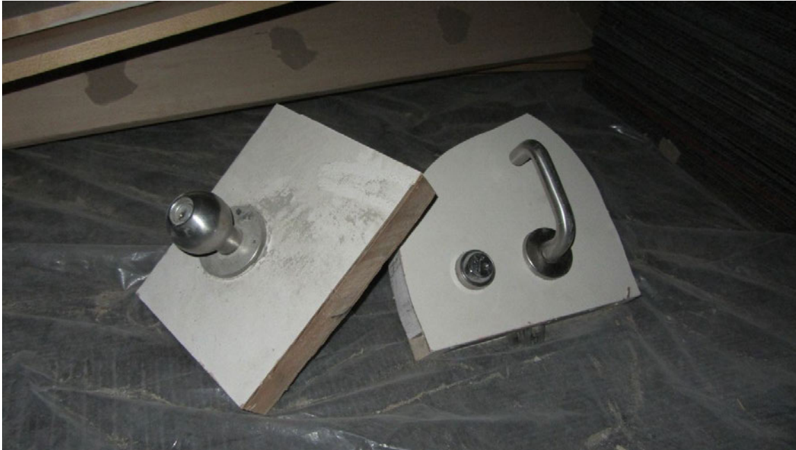
Figure 1 Door knob and door handle stored onsite for reuse in other UBC projects, The contractor mentioned that UBC favors keeping these door handles, Project: University Centre - Contractor: Scott Special Projects