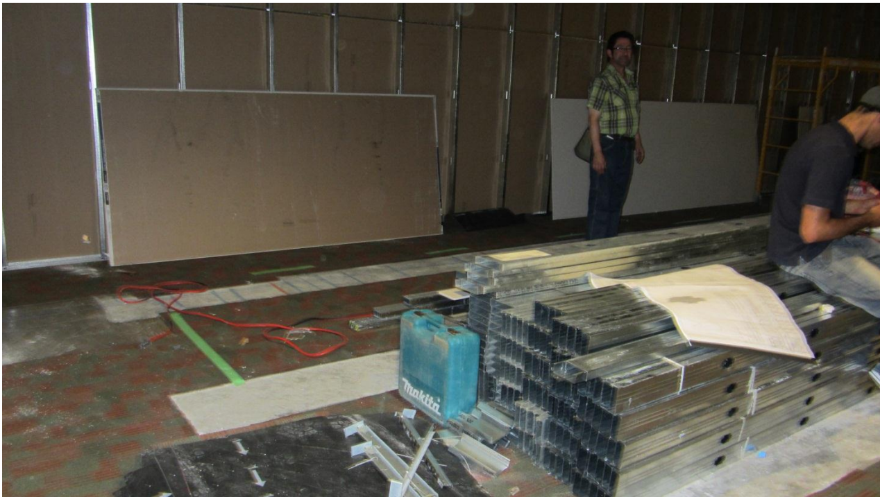
Figure 18 Project: Irving K. Barber Library, Room 310 - Contractor: Aberdane Construction