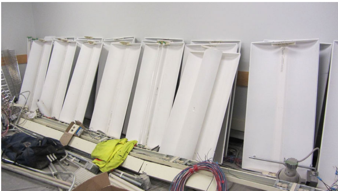
Figure 10 Lightings, stored on-site to be reused in the same project, Project: University Centre - Contractor: Scott Special Projects