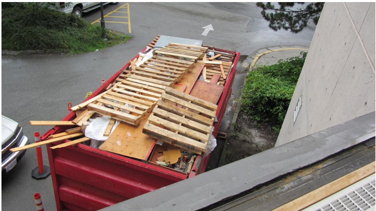
Figure 33 Wood waste in outside of building (one bin can come in at a time), Project: Geography Building - Contractor: EL Shaddai Construction