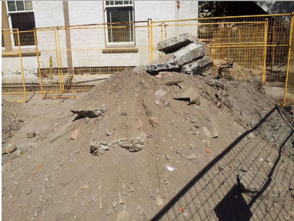
Figure 26 Dust pile collected outside of building on project's site, Project: Geography Building - Contractor: EL Shaddai Construction