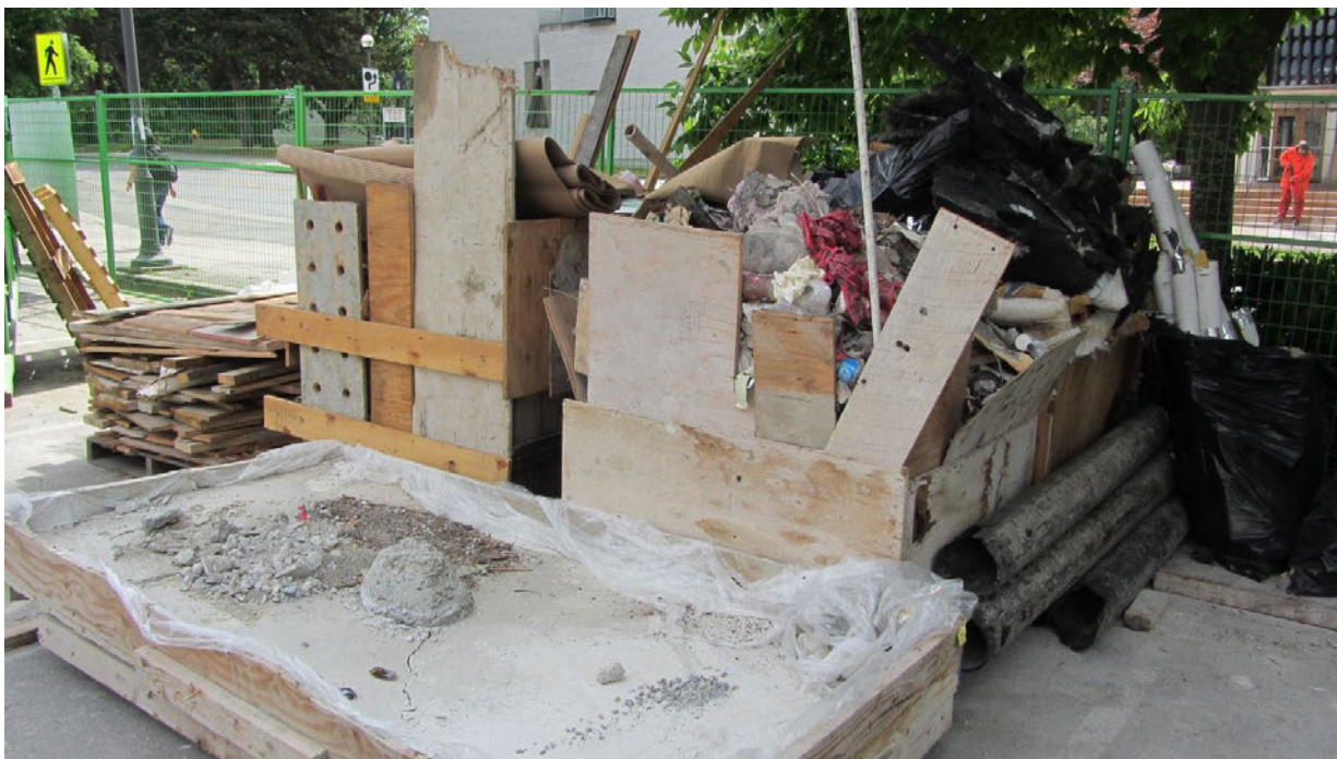
Figure 14 Mixed waste, outside of building on project's site, Project: University Centre - Contractor: Scott Special Projects