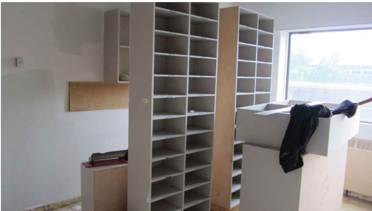
Figure 29 Old wooden shelves, some of the wood may be used for backing during the construction, Project: CEME Lab - Contractor: Holaco Construction