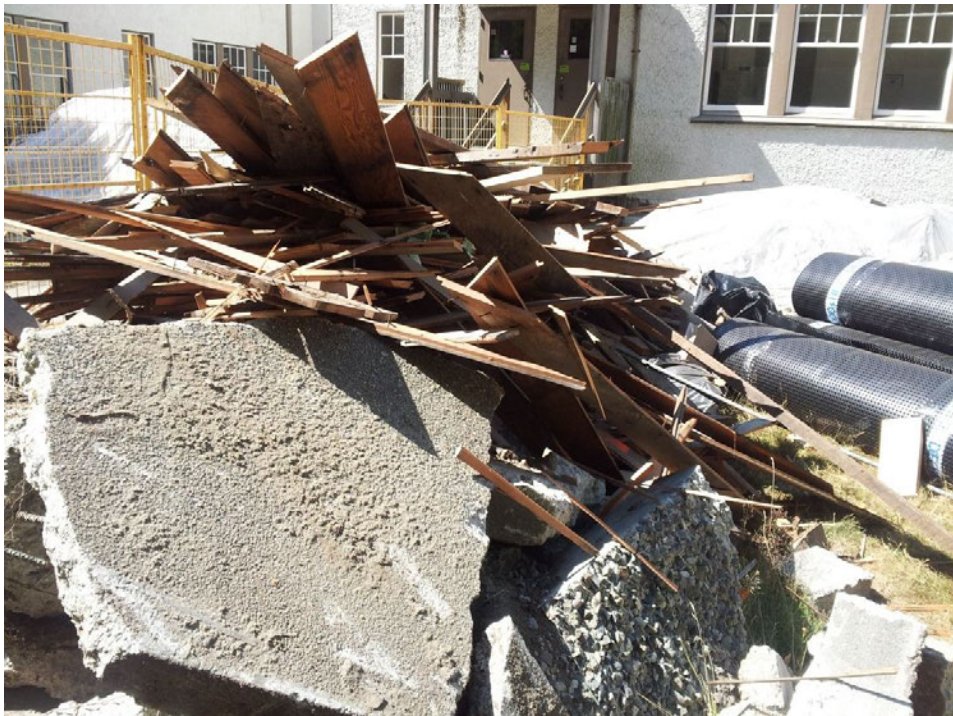
Figure 27 Concrete and wood waste piles collected outside of building on project's site, Project: Geography Building - Contractor: EL Shaddai Construction