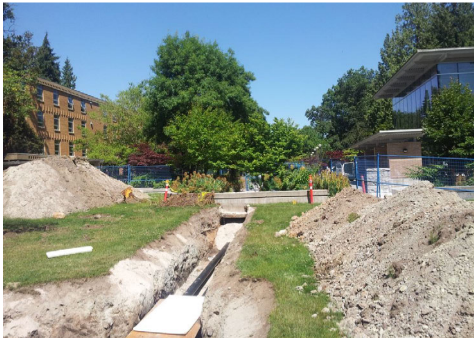
Figure 35 Project's site Project: Place Vanier Residence - Contractor: Division