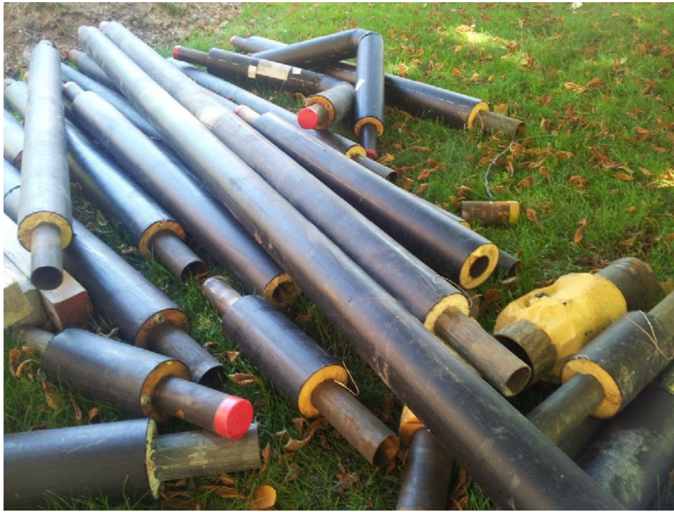
Figure 34 Bonded system piping Project: Place Vanier Residence - Contractor: Division 15