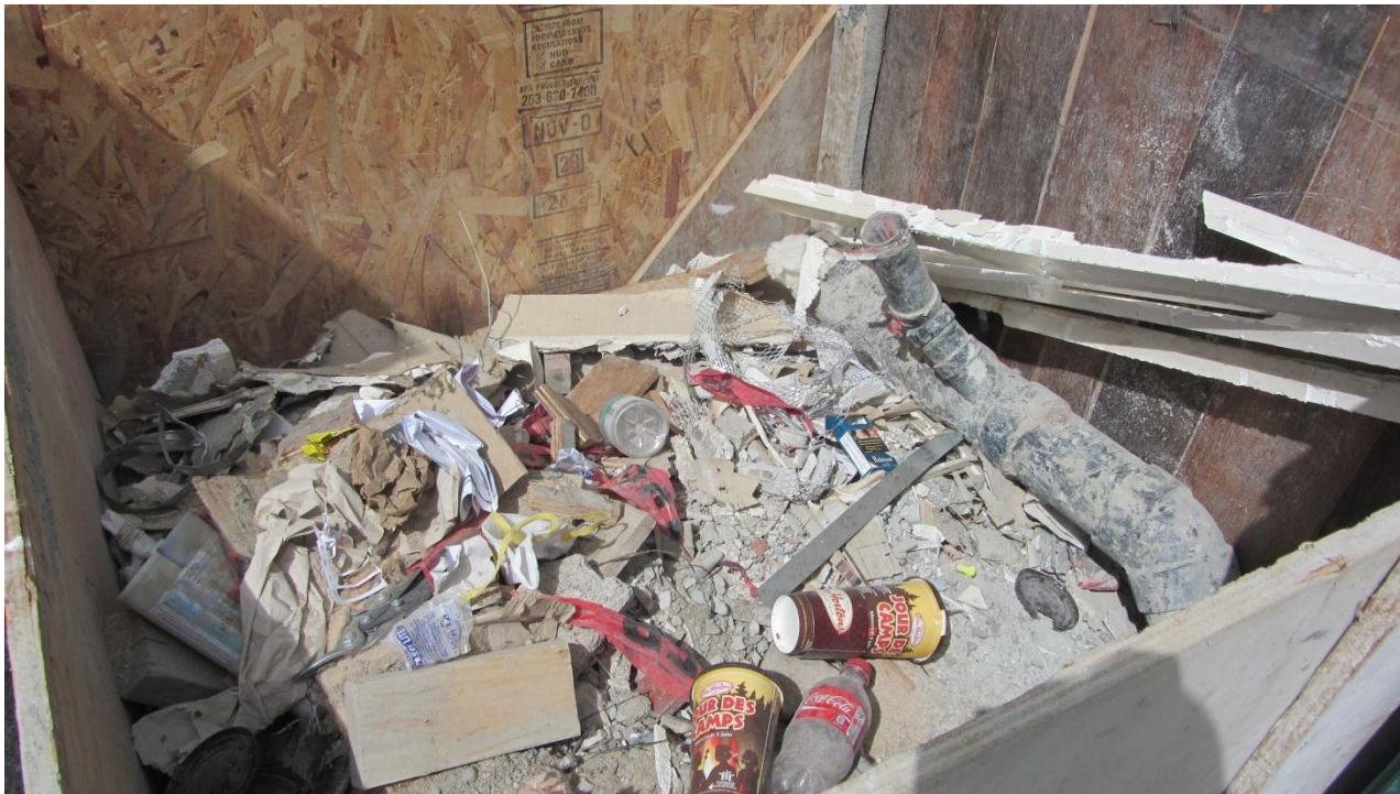
Figure 16 Mixed waste, outside of building on project's site, Project: University Centre - Contractor: Scott Special Projects