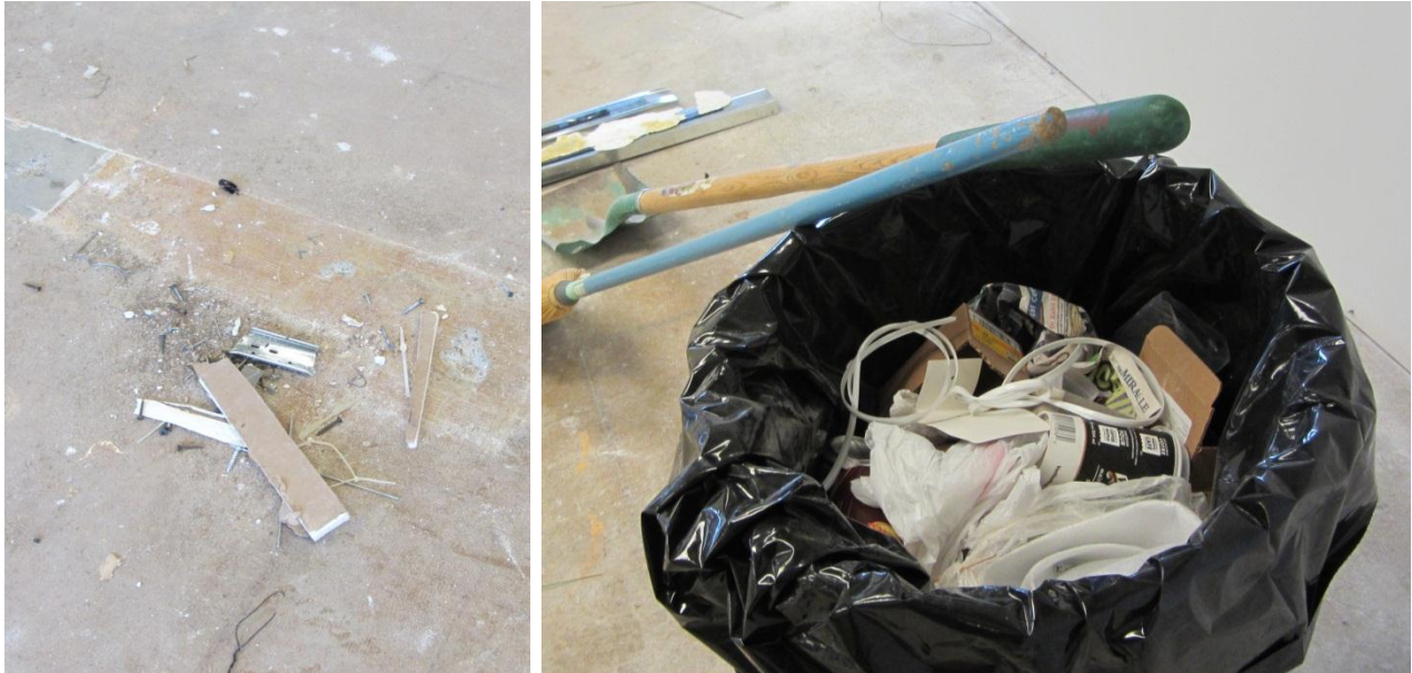
Figure 30 Mixed sweeping waste Project: CEME Lab - Contractor: Holaco Construction