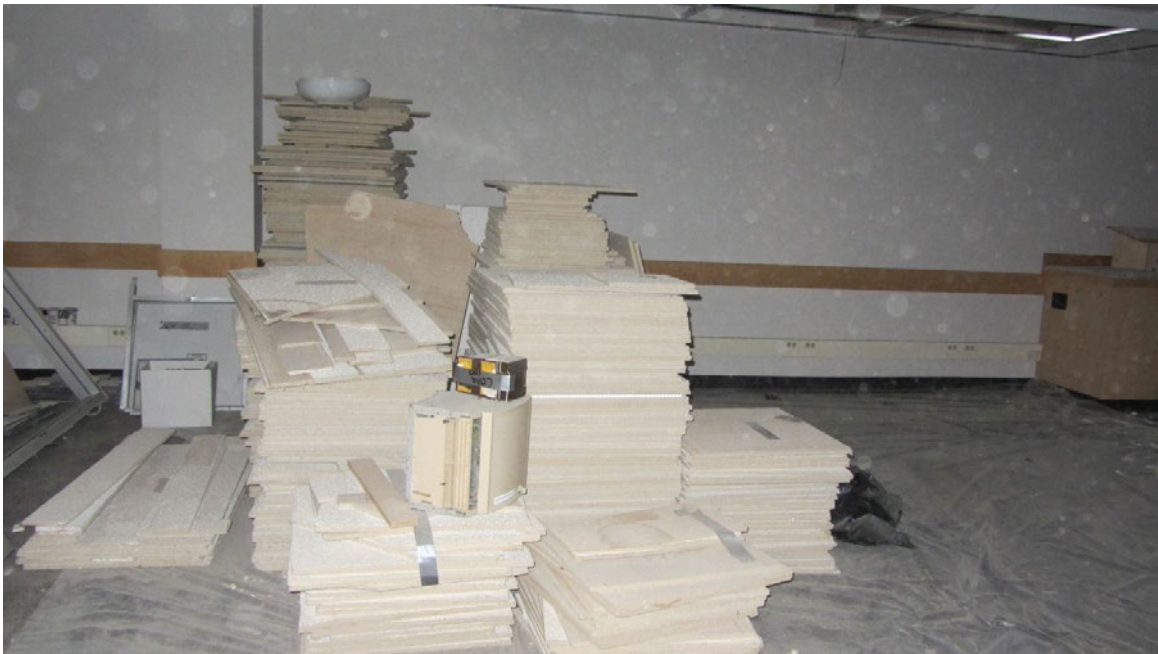
Figure 2 Ceiling tiles stored on-site to be reused in the same project, Project: University Centre - Contractor: Scott Special Projects