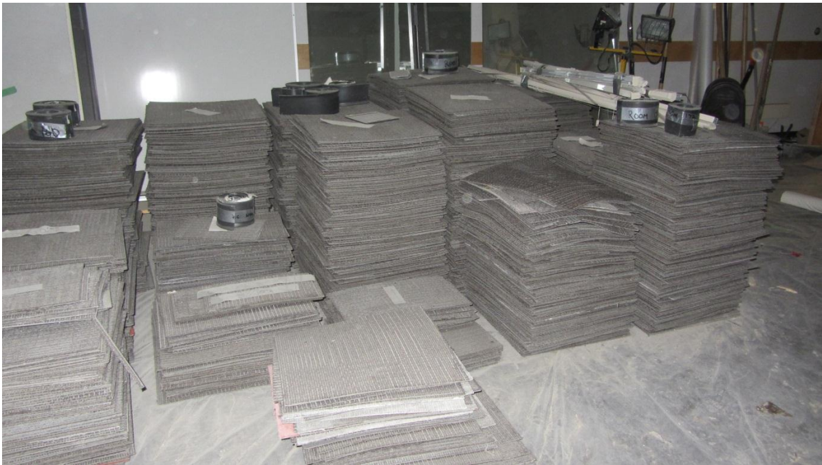
Figure 3 Carpet tiles stored on-site to be reused in the same project, Project: University Centre - Contractor: Scott Special Projects