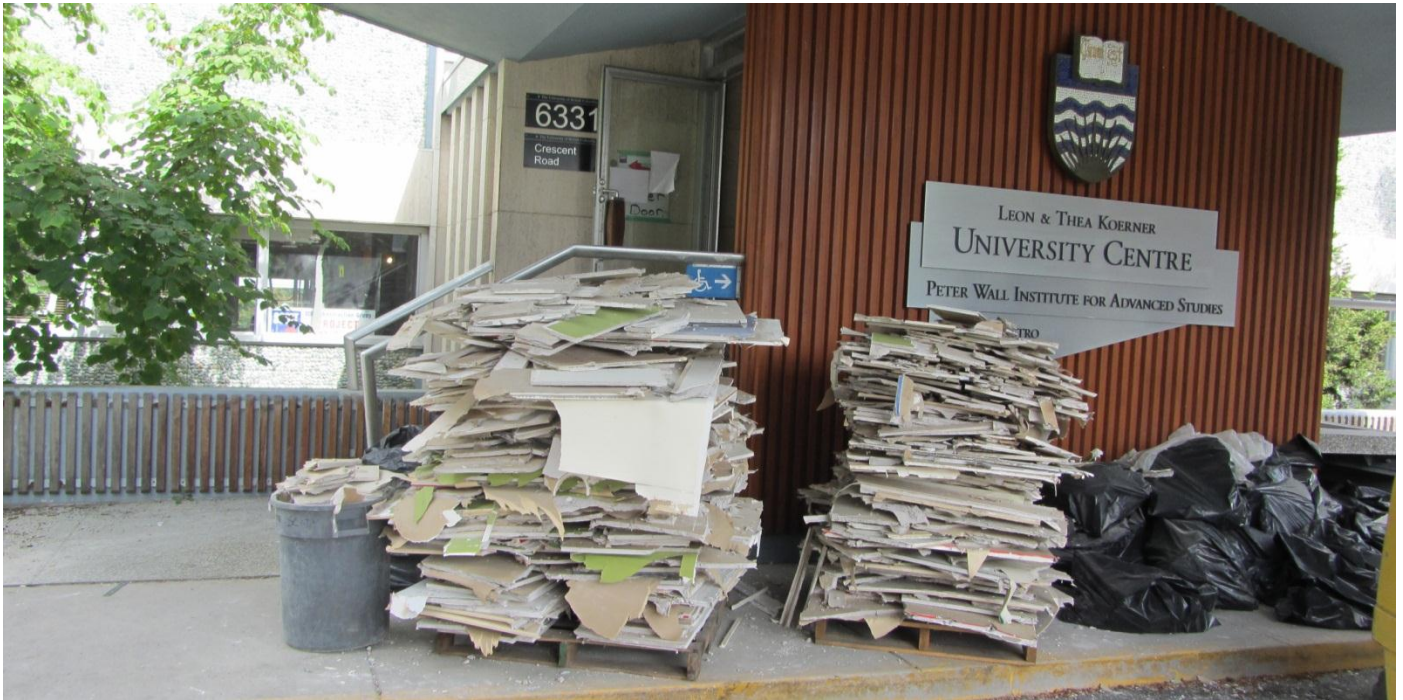
Figure 11 Drywalls, separated for recycling, Project: University Centre - Contractor: Scott Special Projects