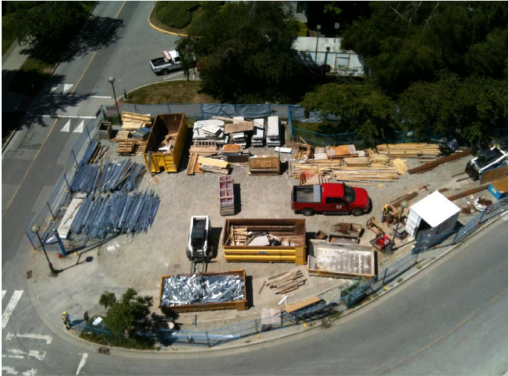
Figure 20 on-site waste separation - Project: Ponderosa Commons - Contractor: Ledcor Construction