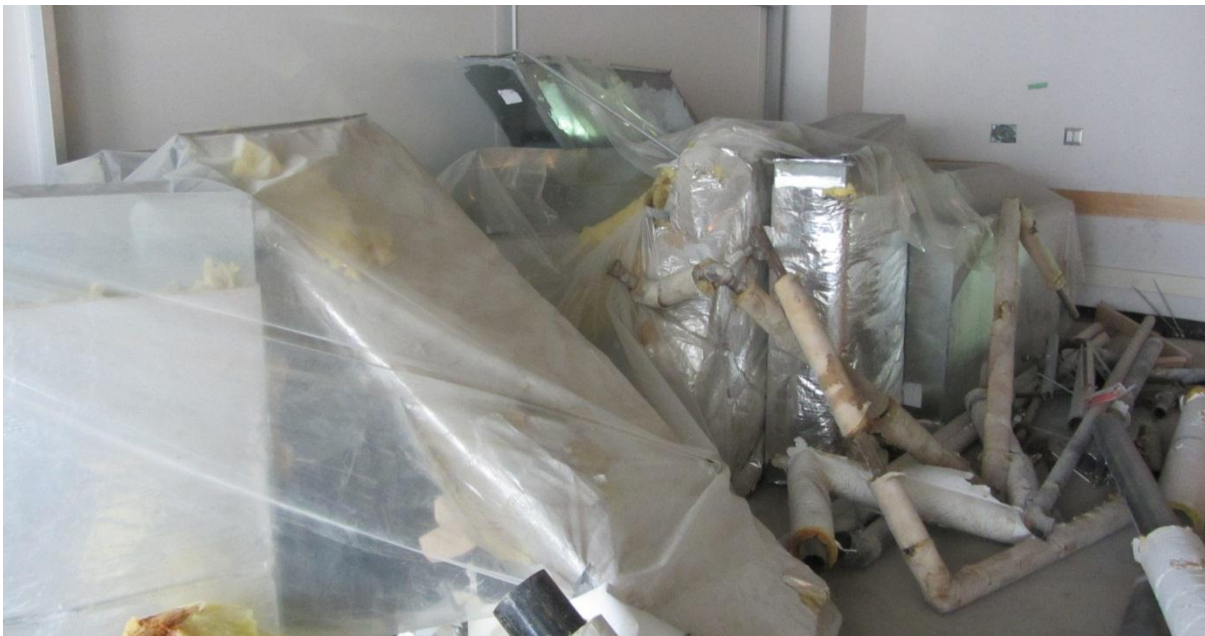
Figure 4 Pipes and air ducts stored on-site to be reused in the same project, Project: University Centre - Contractor: Scott Special Projects