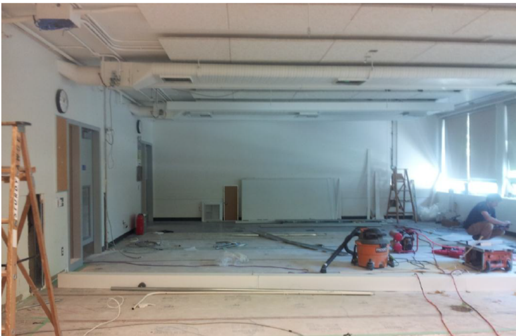
Figure 21 Project: Buchanan B Rooms 202, 204, 206 - Contractor: VPAC Construction