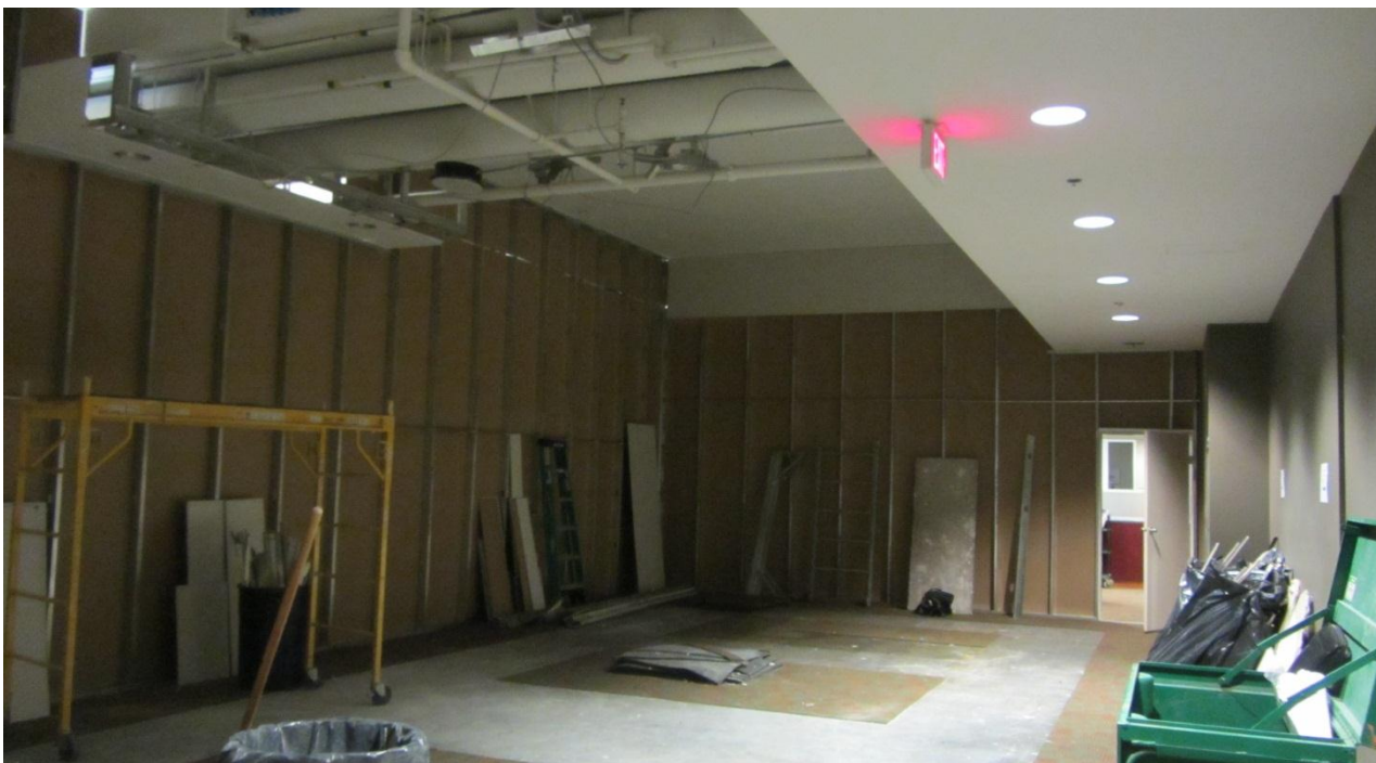
Figure 19 Project: Irving K. Barber Library, Room 310 - Contractor: Aberdane Construction