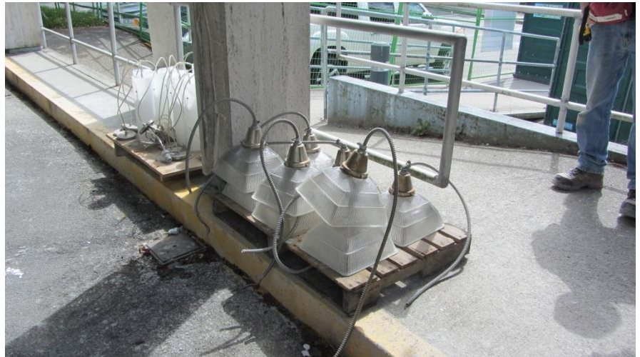
Figure 13 Old decorative lightings, kept outside of building to be given to anyone who want them for free, Project: University Centre - Contractor: Scott Special Projects