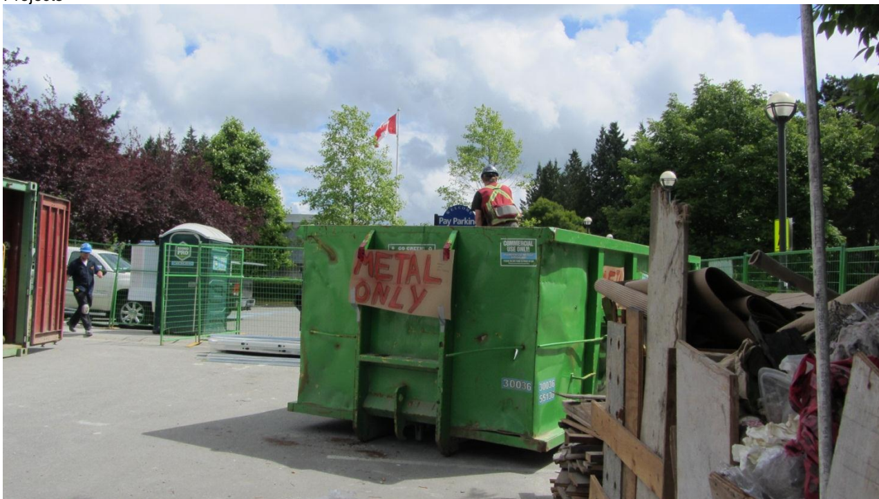
Figure 17 Scrap metal bin outside of building on project's site with a distinguished sign on it, Project: University Centre - Contractor: Scott Special Projects