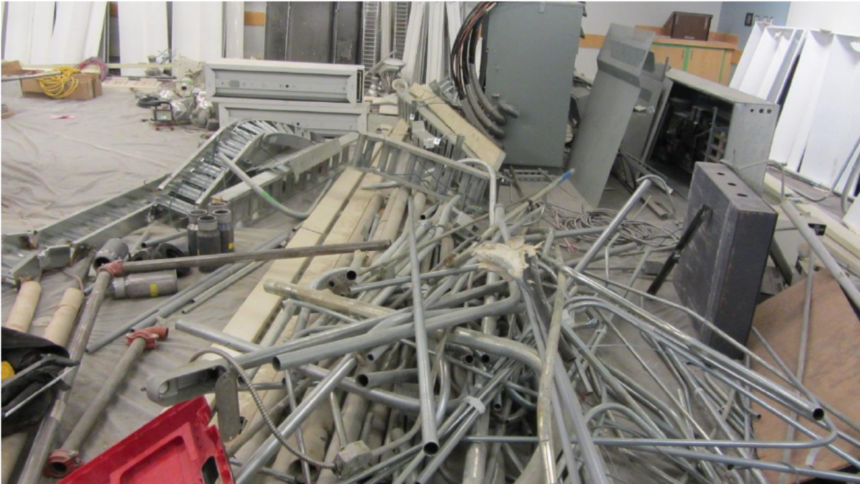
Figure 5 Pipes stored on-site to be reused in the same project, Project: University Centre - Contractor: Scott Special Projects