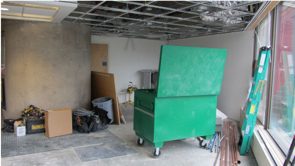
Figure 32 Project: FNH - Contractor: Turn-Key Construction