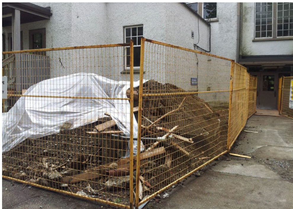
Figure 25 Dust pile collected outside of building on project's site, Project: Geography Building - Contractor: EL Shaddai Construction