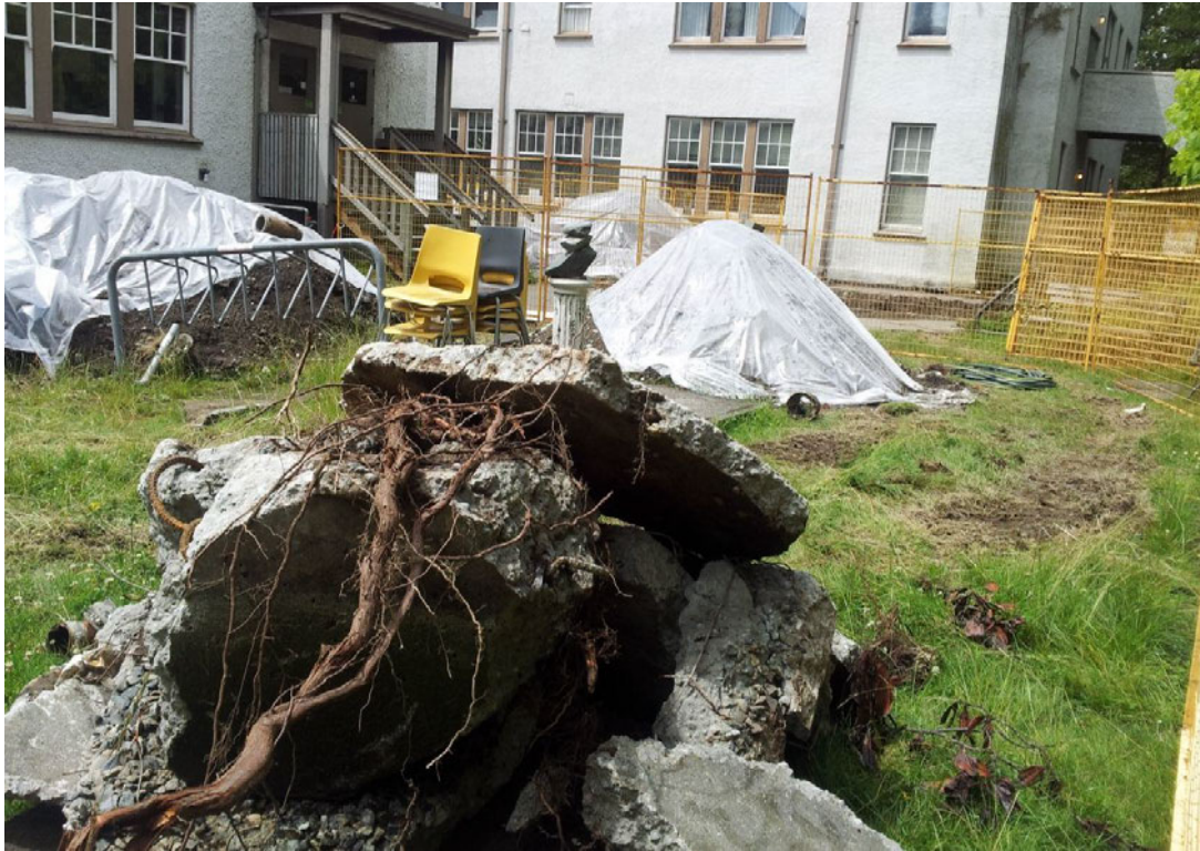
Figure 22 Mixed concrete and shrubberies collected outside of building on project's site, Project: Geography Building - Contractor: EL Shaddai Construction