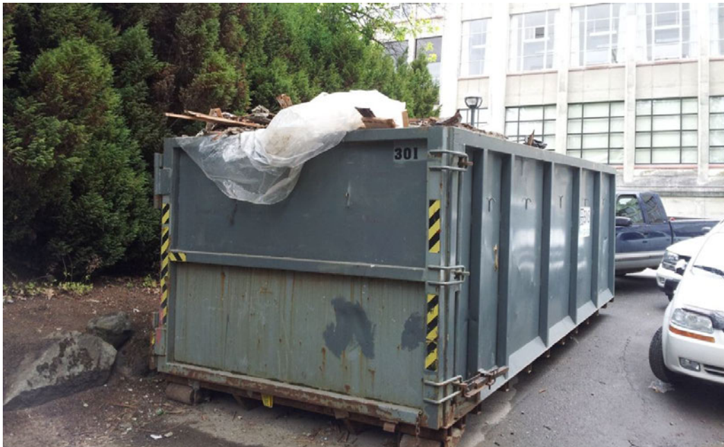
Figure 23 Wood waste bin outside of building on project's site (one bin can come in at a time), Project: Geography Building - Contractor: EL Shaddai Construction