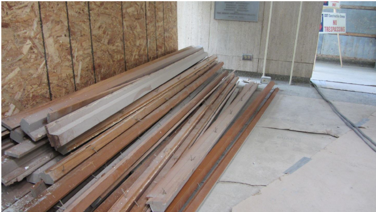
Figure 7 Timber frames stored on-site to be reused in the same project, Project: University Centre - Contractor: Scott Special Projects