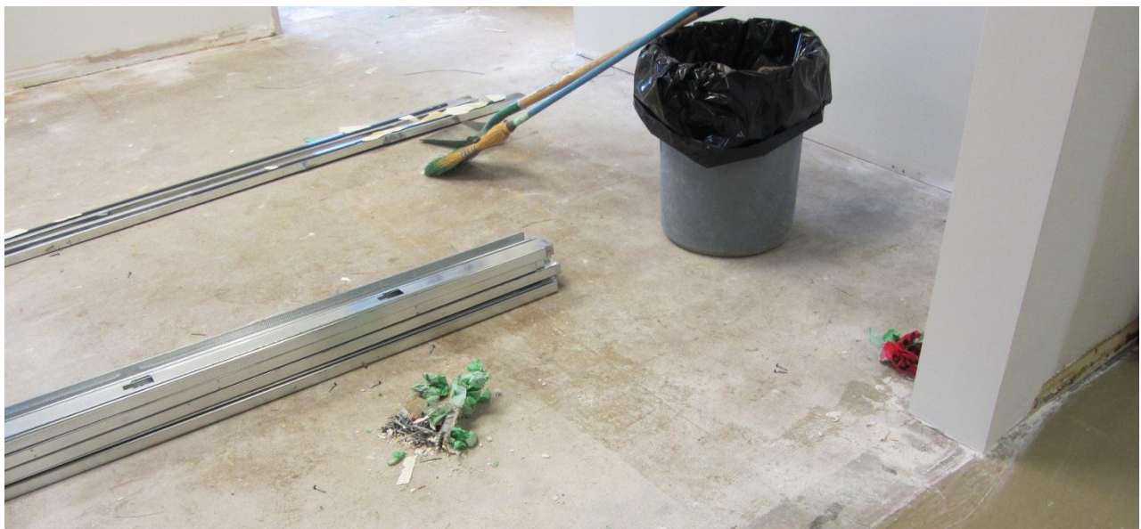
Figure 31 Mixed sweeping waste Project: CEME Lab - Contractor: Holaco Construction