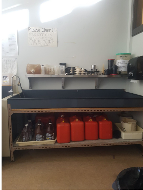
Figure 3: PhotoSoc Wash Basin