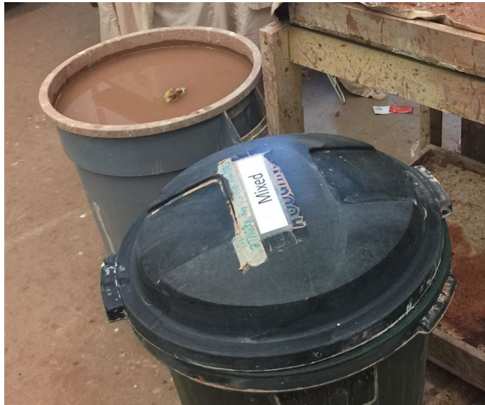
Figure 1: Clay Reclamation Bucket

Water is an essential element in the pottery studio. It is needed during the forming process, as the clay must contain some water for it to be workable on the wheel. It is also extensively used in miscellaneous tasks, such as cleaning tools, washing clothes, rinsing out towels, and general cleanup. Although these processes do not necessarily use a large amount of water, some areas for improvement were identified and will be discussed in more detail. It is worthy to note that various sustainable measures are already implemented in the studio to prevent wasting water. A significant measure undertaken in the studio is that the remaining water in the guards of the wheels are collected in one large bucket and filtered for further clay reclamation. Figure 1 below shows the bucket used to reclaim the clay.