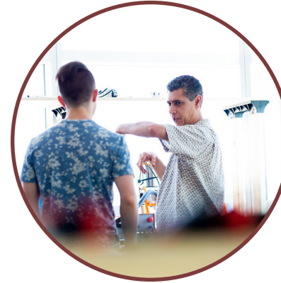
Makerspace UBCO, Kelowna, BC