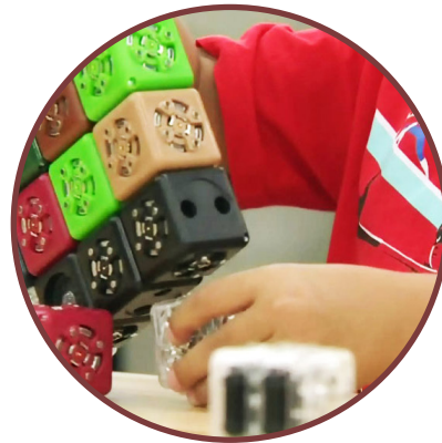
ideaMill, Winnipeg, MB