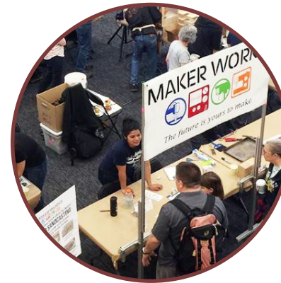
Maker Works, Ann Arbor, MI