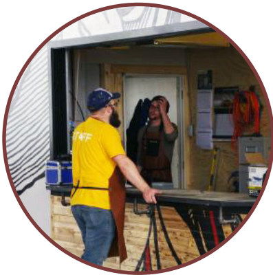
Fuse33, Calgary, AB