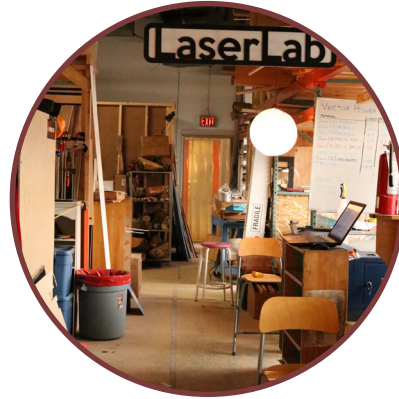
MakerLabs, Vancouver, BC