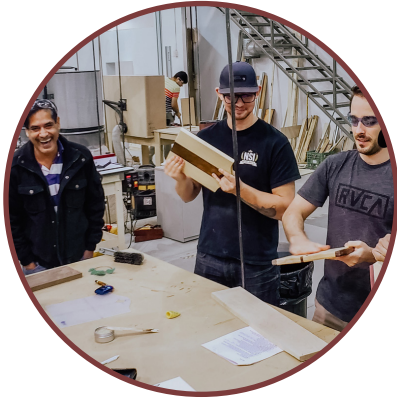
Maker Cube, Langley, BC