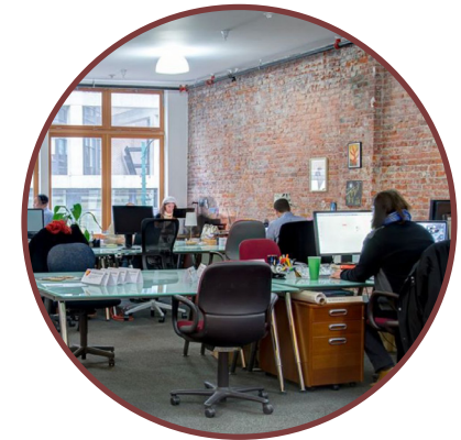
The HiVE, Vancouver, BC

Refer to Appendix B: Case Study Information Chart for a detailed overview of the case studies (page 27)