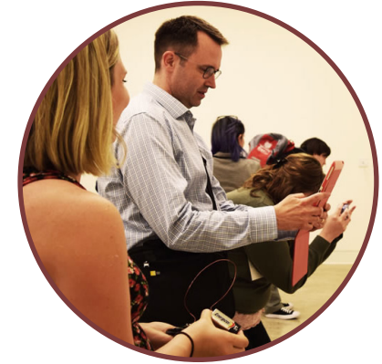
MLabs, Victoria, BC