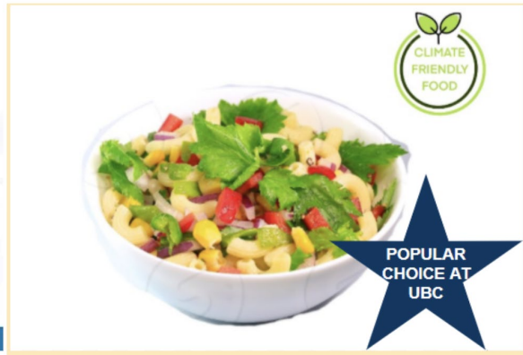
Figure 4. Picture of southwest bowl with image-based label and social norm