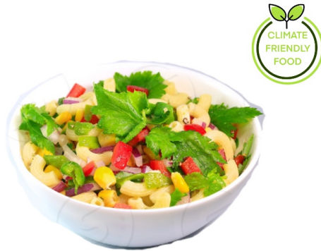
Figure 2. Picture of southwest bowl with image-based label