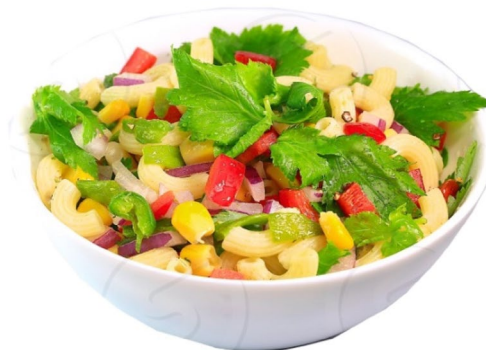
Figure 3. Picture of southwest bowl with text-based label