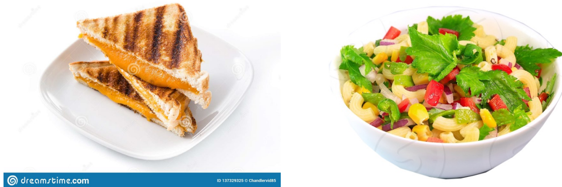
Figure 1. Picture of grilled cheese and southwest bowl