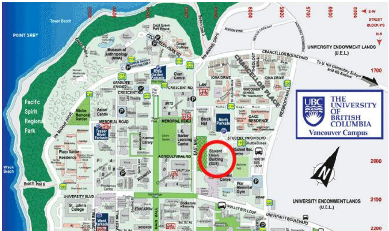
Figure 5. Map of UBC

Note: Red arrow point to Student Union Building (SUB)