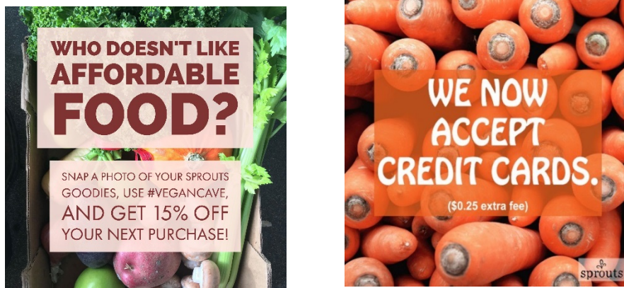
Figure 3. Posts shared on Instagram in February and March 2017. Left: promotion post. Right: information post.

16th (Food and Agriculture Organization of the United Nations, n.d.). All additional posts can be seen in Appendix B. In addition, we have listed a set of most used hashtags corresponding to each special day (Fig. 5). We provided the Board Members with Photoshop post templates that are easy to edit. These templates should give Sprouts Board members a head start for the 2017/2018 school year.