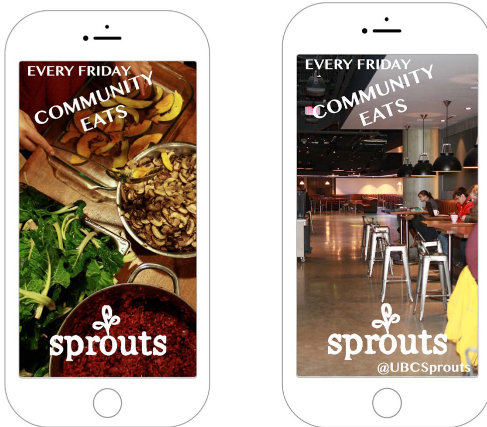
Figure 8. Examples of photos taken with the Snapchat application (bottom) in an area within the geographical vicinity of Sprouts (top).