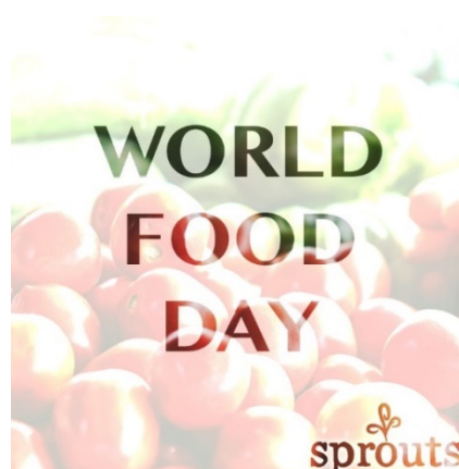
Figure 4. Example of a special day post that Sprouts can share. This post is for World Food Day and can be used each year around October 16.