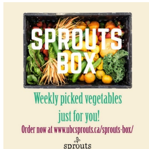
Figure 1. Instagram post for promoting a Sprouts Box. A Sprouts Box is Sprouts' version of a Community Shared Agriculture box.

Our posts invoke curiosity as recommended by Fox and Longart (2016), but still contain enough information for the viewer to understand what is being advertised. For example, a post to recruit volunteers shows the benefits of working at Sprouts and provides contact information should an individual find interest in volunteering (Fig. 2). Other posts act as clear reminders of events (Fig. 2).