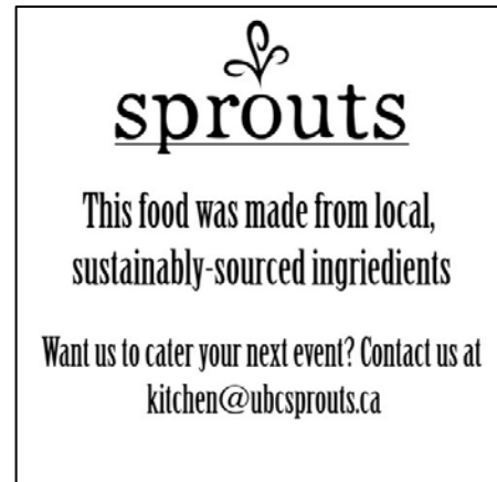
Figure 7. Design of conventional marketing material. Left: stew stamp card design “Buy 10 Get 1 Stew Free”. Right: catering info cards for people to contact Sprouts about catering options on the right.