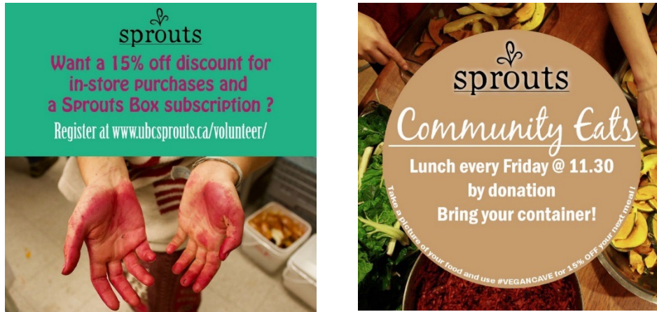
Figure 2. Instagram posts to promote student engagement. The left photo shows a volunteer recruitment post. On the right, the photo shows a 'Community Eats' event promotion post.

We monitored the public response of three of our posts which were released on Sprouts' Instagram account. A promotional post offered a 15% off discount on customers' next purchases if they would post pictures of their Sprouts meal on Instagram and use #vegancave. This post was shared on February 10, 2017 and received about 32 likes in one week (Fig. 3). Since the initiation of the hashtag, 11 Instagram users have posted photos with the tag and redeemed their prize. A post announcing that credit cards were accepted was shared on March 27, 2017, and received 30 likes in one week (Fig. 3). A post advertising the Community Eats event was released March 16, 2017 and received 31 likes in one week. These three posts received an average of 31 "likes" per week.