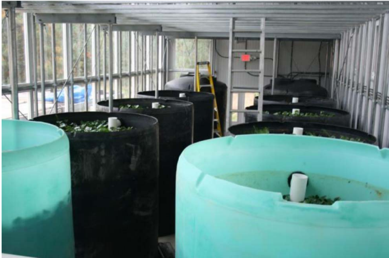
Figure 2 Solar Aquatics System – Christina Lake BC

The UBC Farm building is to be built on approximately 1800 m 2 of area and has 3 floors (A. Rushmere, personal communication, March 27, 2012). If we consider a similar project completed by ECO-TEK in Christina Lake, BC (Rink et al., 2010) then the installation of the SAS in the UBC Farm Center Building has an approximate capital cost of $440,000 and an operating cost of $15,000 per year.